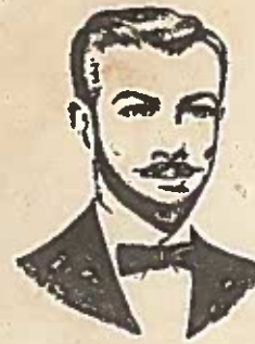
VAN DYKE WITH SIDE BURNS medium haircut with left side part.