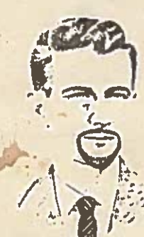
GING BEARD Medium haircut with left side part.