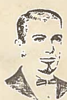
ANCHOR BEARD Fry League haircut with right side part.