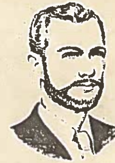
CONNECTED SHORT BEARD Medium full haircut with left side part.