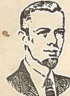
FORMAL POINTED GOATEE Medium haircut with left side part.