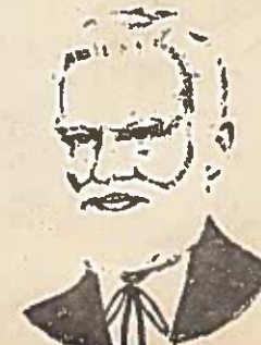
FRENCH OR ENGLISH POBE Worn in the early days of England and France and resembles a two-sided full. Medium full haircut with left side part. COPYRIGHT - ALL RIGHTS RESERVED