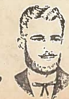
OLD SOUTHERN COLONEL Medium haircut with right side part.