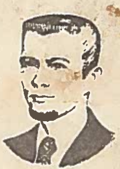
CURLY GOATEE Flat top haircut with sides combed back.