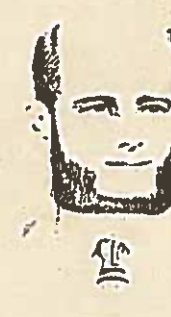
OLD DUTCH Medium sides.