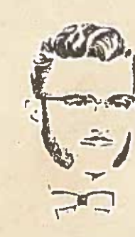
SHORT MUTTON CHOP Medium haircut with left side part.