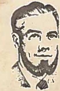
LONG VAN DYKE Medium haircut with left side part.