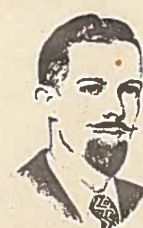
FORMAL GOATEE Medium haircut with left side part.