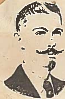
VAN DYKE Van Dyke pattern with bushy mustache. Medium haircut with left side part.

Style by: ASSOCIATED MASTER BARBERS AND BEAUTICIANS OF COLORADO