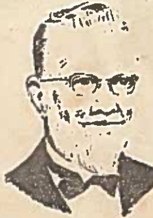
MODERN ABE LINCOLN Medium full haircut with left side part.