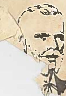
CONNECTED MUTTON CHOP Medium full haircut with right side part.