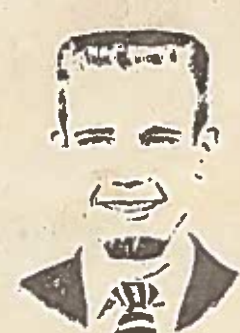
FLAT BOTTOM GOATEE Flat top haircut with medium sides.