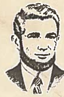
ABE LINCOLN BEARD Full sides with right part.