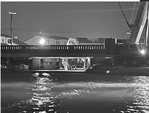
Withdrawing the submerged construction equipment

When the second half of the bridge is completed, both sides will be finished with a new smooth asphalt topping. The project is expected to be completed by late summer.