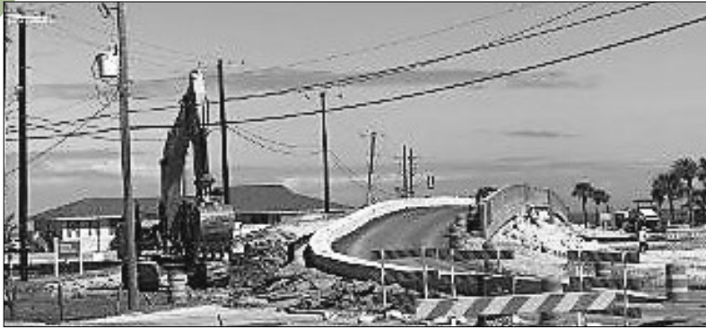
New lane opened in early March

During the second week of March, the contractor implemented a lane shift for motorists crossing the bridge, which did not require any changes to the traffic control and safety plan implemented last summer. With the shift, the contractor began work on the second half of the bridge.